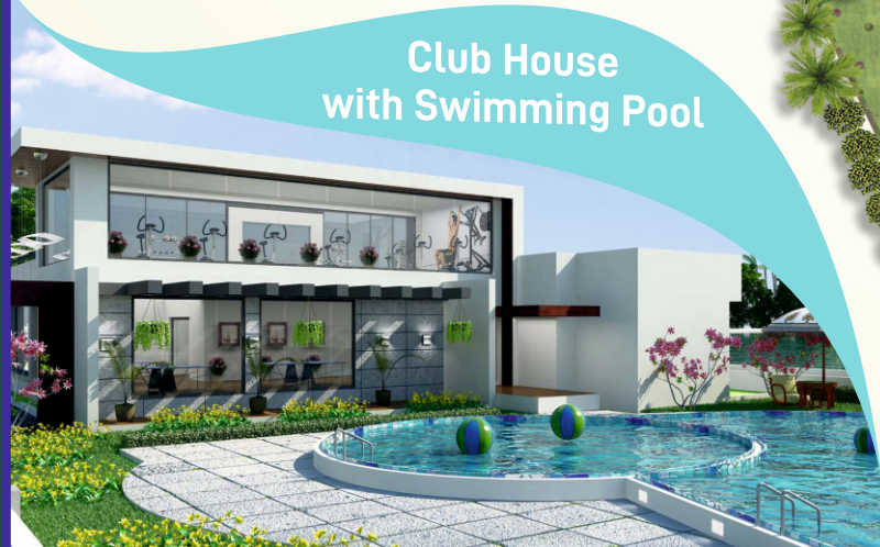
Club House with Swimming Pool